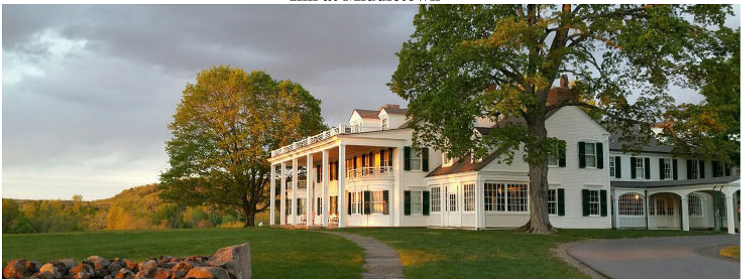
Hill Stead Museum