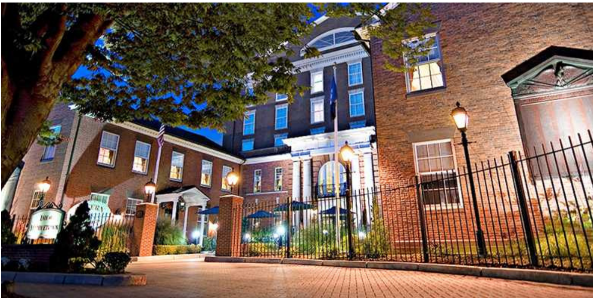
Inn at Middletown

September 20: Continental breakfast at the Inn 11 am: Hotel check-out